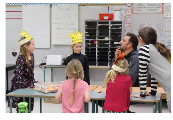
SANGUDO COMMUNITY SCHOOL